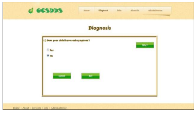
Fig. 2. Displayed question and answer chosen by user.

The design of this system is user friendly because it provides a good interaction between systems with user. In this system main page, there are providing skin diseases info and treatment info for user to view by clicking the button. As shown in Fig. 1, the diagnosis page also provides instruction button to help user identify their next step. User can click the "Start" button to start the diagnosis process. Then, a set of question regarding children skin problem symptoms were asked.