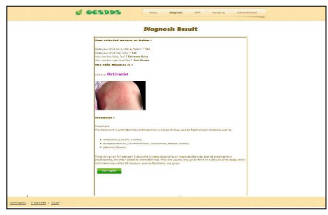
Fig. 3. Diagnosis result interface.

Fig. 3 shows a sample screenshot of possible diagnosis result when user has completed answer all the questions. In this page, user can view the symptoms that chosen from question list, type of children skin disease infected the children, and its treatment. In addition, user can start the diagnosis process again by clicking 'Diagnosis Again' button or quit the diagnosis process by clicking 'Exit' button.