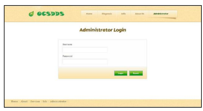
Fig. 4. Login page for administrator.

Fig. 3 shows a sample screenshot of possible diagnosis result when user has completed answer all the questions. In this page, user can view the symptoms that chosen from question list, type of children skin disease infected the children, and its treatment. In addition, user can start the diagnosis process again by clicking 'Diagnosis Again' button or quit the diagnosis process by clicking 'Exit' button.