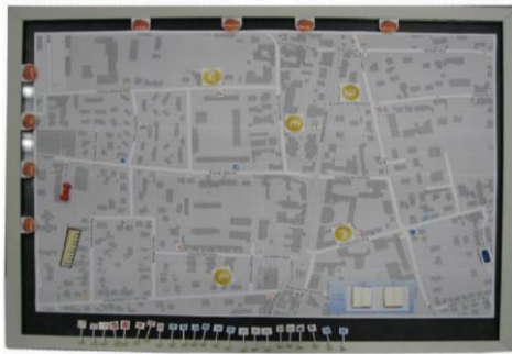
Fig. 1. Paper prototype of a tabletop.

simple bar chart that shows the amount of errors committed and money taken by each team. The mirroring tool is visible on the bottom-right corner of the tabletop (Fig. 1).