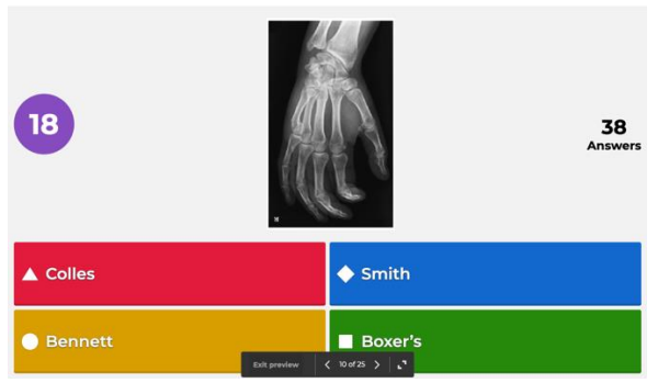
Fig. 2. Multiple choice question generated and made available to MIR students within the Kahoot environment, in the subject of methods and techniques in medical imaging.