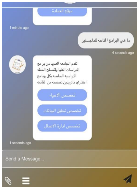
Fig. 3. Question about available master programs.