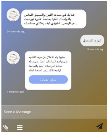
Fig. 2. Chatbot welcome message.

technique. It seeks to show the probabilistic relationship between distinct variables and identify which group they are most likely to belong to while taking the variables into account. Fig. 2 shows the welcome message of the chatbot and Fig. 3 shows question and answer about the available Master programs. One of the benefits of this platform is that the chatbot is trained using a platform feature that records all inputs submitted by the user that were not recognized by the chatbot. The platform also provides a general report on the chatbot and the conversations that were conducted with all users to provide an opportunity to improve the chatbot's performance.