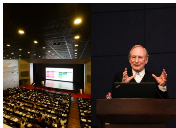
Fig. 1. The second academic week held by School of Architecture and Fine Art of Dalian University of Technology.

the activity with superior effectiveness. The second activity was launched in the October of 2017, so as to further the academic ambience and exchanges, and to improve the popularity of the university. The school invited relevant professionals, in joint efforts, to explore the origin of architecture and arts, to carry forward the spirit combined with critical thinking and technology, and to review the duty and role of contemporary designers. During the event, a series of 18 lectures was arranged by a group, led by Toyo Ito, of illustrious architects and critics of architecture, inside and outside the country.