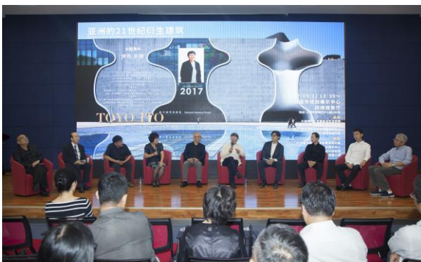
Fig. 3. Academic salon held in academic week.

Through the integration of multiple disciplines, e.g. architecture, ekistics and arts, and the advantageous disciplines of Dalian University of Technology, e.g. logic, engineering, technology and liberal arts, the Academic Week of School of Architecture and Fine Art covered various scopes like architecture, ekistics, designs and fine arts. As in Fig. 3, the event adopted several integrated perspectives [6], attracted talented personnel from dozens of disciplines, e.g. ekistics, architecture, landscape science, configuration and visual communication, and thoroughly presented the ideas and exploration regarding the essence of construction and the spirit of arts in China at the present moment.