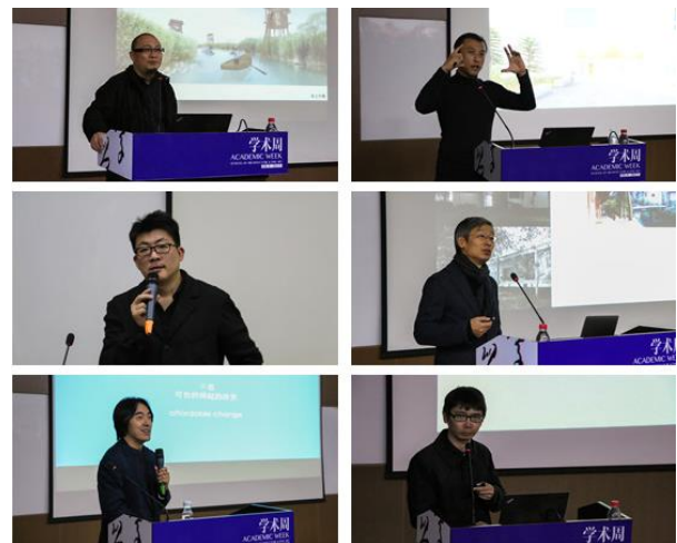
Fig. 6. Speeches given by outstanding young architects.

As in Fig. 7, in the beginning of the term, the school stimulated teachers to arrange the event in an enthusiastic manner, based on which the detailed scheme of the event was publicized together with the billboard presenting all academic activities. Apart from the academic seminars presided by teachers, the event arranged a special session concerning students’ academic activities, in which seven students who was in charge of fund programs presented their mid-term reports and experienced teachers were nominated to give their opinions, so as to urge students to complete their programs on time, with required quantity and quality, and to enhance students’ enthusiasm and interests to participate in academic activities. This session has been the highlight in the activity, boosting great innovation.