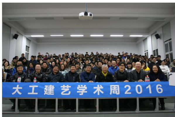
Fig. 8. Academic week in 2016.

respect the efforts of experts and professionals outside the university, the school arranged a joint conference between the Party and the government, in which the Associate Dean was identified to lead the event, the Departments of School and Teaching Affairs were required to coordinate and corporate and the Office of Students' Affairs was responsible to nominate people in charge of attendance, thereby recording students' participation in details. The Office of Teaching Affairs was required to arrange various academic activities and ensure the presence of relevant teachers and experts from outside. (see Fig. 8 and Fig. 9)