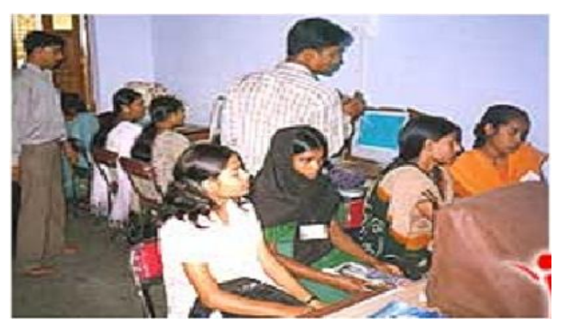
Fig. 1. Rural computer lab

department, rural schools have improving its infrastructure facilities. But the development is not uniformly in all rural areas; still many areas are neglected from even basic infrastructure facilities. Though, governments are providing ICT facilities to rural schools. Many of them are not working properly. The reasons such as, lack of accessibilities of the facilities by the beneficiaries, beyond the level knowledge of users and not full fill their needs or beyond their level of needs. Thus, whenever implement the ICTs related programmes in the rural areas, should be assess local conditions and priorities needs of rural students. The assessment of needs should be following the methods of dialogue, survey and discussion with beneficiaries in rural areas. First they have to understand the real benefits of the programme then only it will sustain in long term and perform effectively in rural areas.