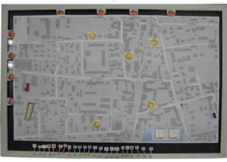
Fig. 1. Paper prototype of a tabletop.

simple bar chart that shows the amount of errors committed and money taken by each team. The mirroring tool is visible on the bottom-right corner of the tabletop (Fig. 1).