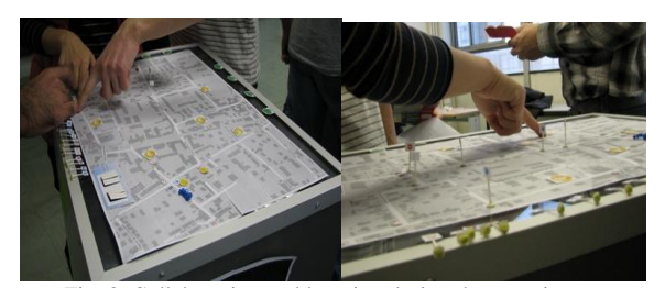
Fig. 3. Collaboration and learning during the experiment.

The results from observation show that a part of collaboration is done among the team members to decide about a strategy to reach the best results. Locating the correct signs on the road while following the game rules was the main cause of collaboration as can be seen in Fig. 3. Participants asked many questions from each other and asked help regarding the game rules, traffic rules and meaning of signs. Almost the whole time of the game, players were busy discussing with each other even between their turns. They tried to estimate their opponents' actions and reach agreement for their future activities. The results from questionnaire and observation show that the participants enjoyed playing the game and found the game scenario attractive.