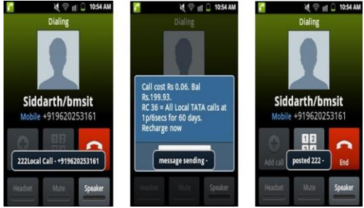
Fig. 3. Snapshots of execution.

The following snapshots in the Fig. 3 show the software execution on an actual android phone with toast messages. Toast message is a notification which ensures the successful execution of respective loops. In the snapshot siddhart/bmsit is the person to whom the user has given call to for help.