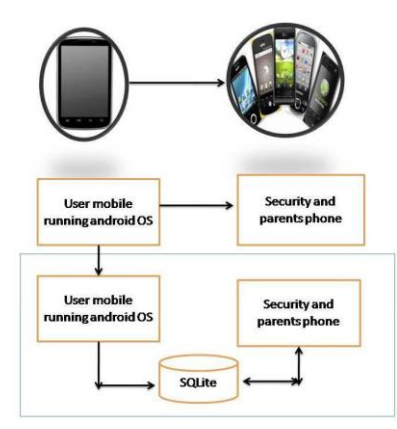
Fig. 1. Architecture of proposed system.

One can easily get to know that the user needs help. It also brings the current location of the user (victim). These alert messages are sent to the security and parent's mobile as a SMS format. The public can also view and offer help with the help of the cloud service in which they can track the position of the victim at any time. It is possible to track the exact position of the victim with the help of Google Maps; with the help of latitude and longitude values it is possible to locate any position (see Fig. 1).