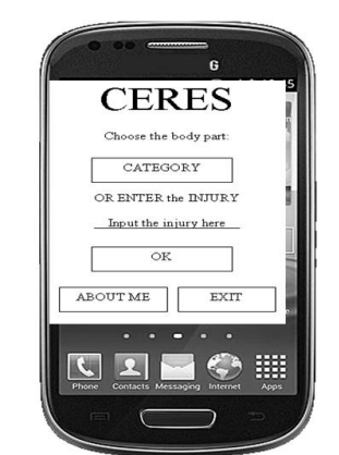
Fig. 2. CERES' start-up activity menu.

Fig. 2 displays the CERES' start-up activity menu. Once the user selects his option, the system will display the appropriate information. There are three (3) major categories of physical injuries available in the system: a) head injury, b) upper body injury and c) lower body injury. These can be displayed in the mobile screen in a button list format.