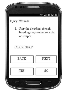
Fig. 3. CERES' solution generation activity.