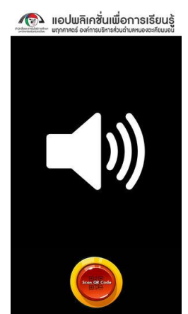
Fig. 4. The sample display voiceover through NTKB application.

3) Listen to the voiceover through NTKB Application