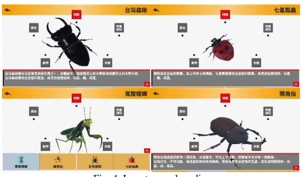
Fig. 4. Insect encyclopedia.

3) In order to increase the chances of successful student breeding, provide information on insects such as cockroaches, unicorns, cockroaches and ladybugs, including characteristics, life, food, natural enemies and living environment.