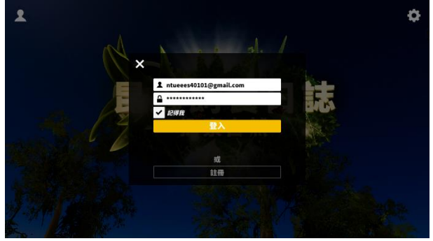
Fig. 2. Registers account number.

1) Each student registers their own account number in order to manage the growth of the insects they keep.