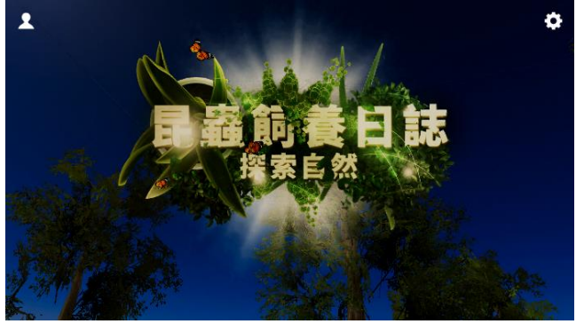
Fig. 1. Logo page for insect feeding game.

The insect feeding game APP was developed by the team of professor Hong at National Taiwan Normal University. It was developed for elementary school students and research situations. There are four different insect feeding tasks in the game design. After entering the game, students must follow the insect breeding needs. Conditions for the game, including food, growing environment and natural enemies and other factors affecting growth, until all growth conditions are in line to allow insects to grow up smoothly, and there is no restriction on the type and number of insects to be kept, students are free to choose the game task.