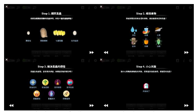
Fig. 3. Insect feeding game operating instructions.

Enter the operating instructions to understand how to = choose insects, find food, solve insect troubles and be careful with natural enemies.