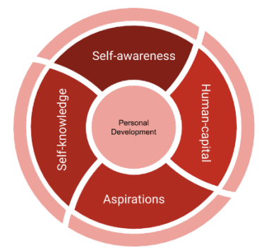
Fig. 2. Elements to buildup personal development.

Self-awareness [15], self-knowledge [16], human-capital [17], and aspirations [18] are some of the vital elements in the personal development theory (Fig. 2) related to the industrial program, leading to the success of building a student's career. During the self-confidence formation process: identity and leadership skills can be grown through the role mode effect. A fresh trainee needs a good mentor to teach them how to lead a team in a workplace [19]-[21] and how the job can be done, etc. Without a good mentor, some intangible knowledge cannot be easily inherited to the next generation. This is also how the self-image formation can be achieved in certain professional industry, such as wearing a uniform required by some occupations [22].