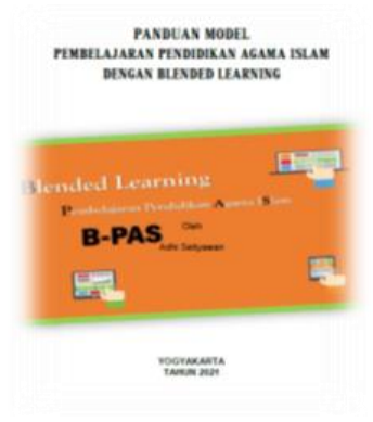
Fig. 5. The model book.

The model book (see Fig. 5) contains an Introduction, including Background, Problem Identification, Product Specifications Developed, and Product Benefits, and IRES mixed learning (B-PAS), including the Development of IR Education Learning Models (IRES) Learning Theories and Implementation of the BL IR Learning Model (Model Implementation Learning Design, Syntax of the B-PAS model, social systems, Reaction Principles, Support Systems, Instructional Impacts and Accompanying Impacts, and Instructions for the Use of e-learning.