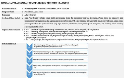
Fig. 3. Lesson plan.

The lesson plan contains the identity of the course, study program, author, course description, learning achievement, and competency map. The lesson plan is the implementation plan for the B-PAS learning (see Fig. 3.).