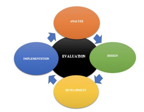
Fig. 1. Process of the AR development.

After all of the AR processes had been developed, the AR application was put through usability and feasibility testing to ensure that it achieved its aim, which is to help students overcome misconceptions and provide a deeper understanding of physics concepts because abstract notions in the concepts can be visualised into concrete ones through the AR simulations. The results of the usability and feasibility test showed that the application fulfilled the purpose of the application's development, which is to help students overcome misconceptions and provide a deeper understanding of physics concepts. The usability test indicators are detailed in Table II.