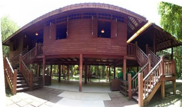
Fig. 4. Example of the result of virtual museum for Thai house.