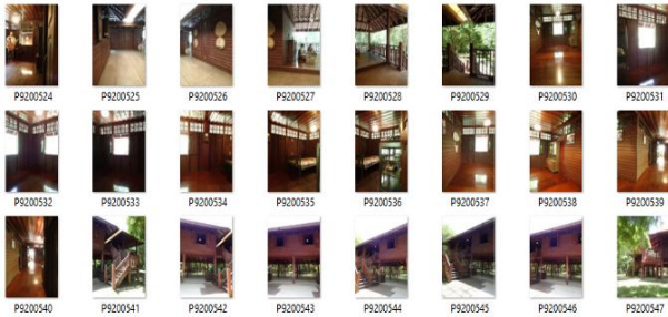
Fig. 2. Example of Thai style houses.

To develop the system, a researcher used Visual C#, Adobe, and took pictures and important parts of Thai style houses in four regions. Fig. 2-Fig. 5 show an example of development process.