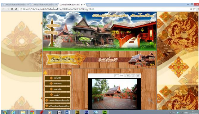
Fig. 5. The interface of virtual museum website.

To assess the systems, a researcher asked 50 system experts including students and other people to volunteer in assessment. The subjects were asked to rate the relevancy of the search results on a five-point scale: Score 1 is the level of satisfaction improvement, Score 2 is minimum level of satisfaction, Score 3 is medium level of satisfaction, Score 4