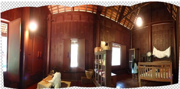
Fig. 3. Process of merging temple image.