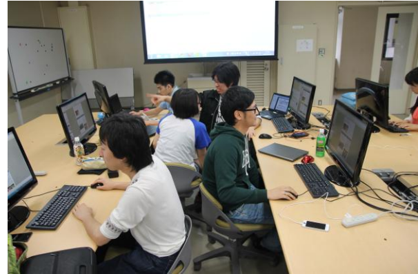
Fig. 1. Group work.

For this study, students were put into group of four and were asked to create a PPT for collaborative assignment. Fig. 1 shows how the students are working collaboratively on one PPT in a group.