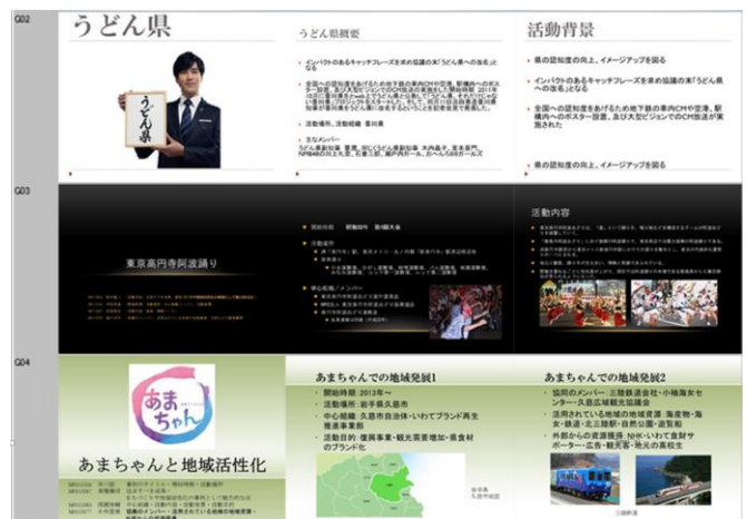
Fig. 2. Shared PPT file.

For this study, we developed a new function that can be added to the system that also encourages communication between different groups. We developed a system in which each groups' PPT can be extracted into one large file. Fig. 2 is the example of how we used this system to extract all groups' PPT slides into one file. This file was projected in front of the classroom by the instructors. In this fashion the instructor commented on each group's work and students were able to see what other groups are doing while they work on their own.