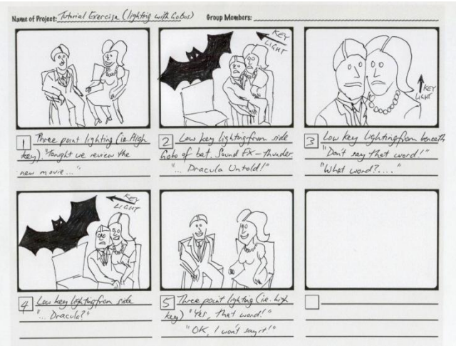
Fig. 2. Tutorial Exercise – Three point lighting, low key lighting and gobos.