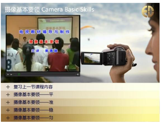
Fig. 6. Interactive TV program "camera basic skills".

This study selected "computer + set-top boxes" as study instruments. Flash technology was used to realize Interactive Navigation Process in digital educational television programs. At the same time, programs were installed in the set-top box for playback.