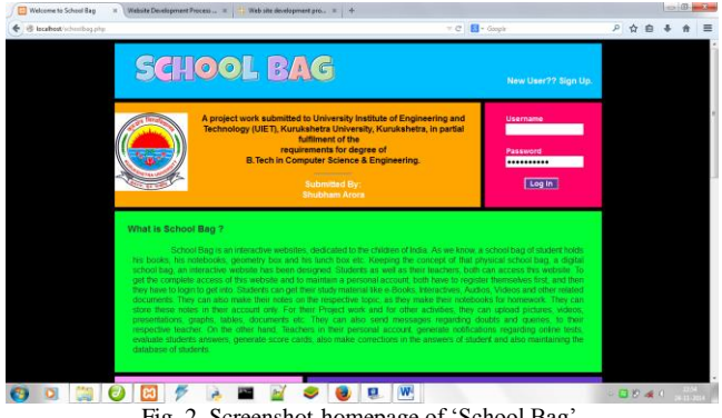
Fig. 2. Screenshot-homepage of 'School Bag'.

are always welcomed to make it ultra-big.