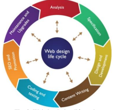
Fig. 3. Website design life cycle.

There is an essential need of digital literacy and lifelong learning for developing country like India. Analyzing these requirements, a practical approach has been proposed to develop an interactive e-portal. This gives rise to planning of the project 'School Bag'.