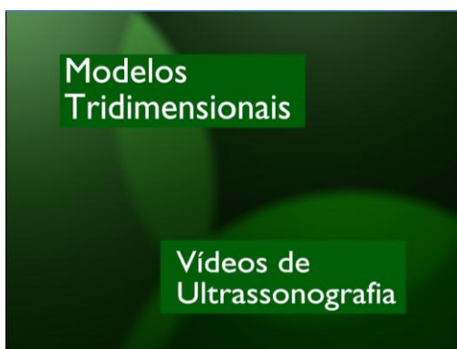
Fig. 2. Second screen of the system menu EMBRIO v2.0.

In the case of our VLE, there aren't ultrasonography videos available yet. When clicking at the button to visualize the 3D-models of human embryos or fetuses we can see several options according to the age of the conceptus (Fig. 3). The user can choose any age present in this menu, and to illustrate the system, we chose the button Terceira Semana (Third Week) on Fig. 3, which leads to Fig. 4.