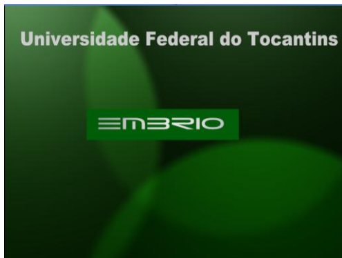
Fig. 1. First screen of the system menu EMBRIO v2.0.

options: studying three-dimensional models of human embryos or fetuses or ultrasonography videos (Fig. 2).