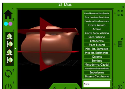
Fig. 5. Three-dimensional schematic model of a 21-day embryo where features of graphical interface are numbered from 1 to 9.

Fig. 6 shows a transversal cut of the 21-day conceptus from Fig. 5. This model is generated after clicking in the white circle associated to number 2.