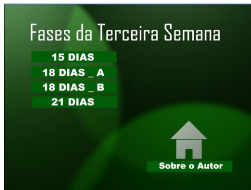
Fig. 4. Screen related to the choice of the option Terceira Semana (Third week), from the system menu EMBRIO v2.0.

understanding of the 3D-model. Features associated to number 3 allow the user to move the 3D-model using the mouse (there are also keyboard shortcuts to do the same thing). Number 4 allows to return to the complete model from its cut. Feature 5 turns off the system. Features associated to number 6 allow to navigate the system, going to the previous 3D-models (left arrow) or next models (right arrow). Number 7 represents subtitles that show the names of the conceptus' parts when we pass the mouse over them. Feature number 8 represents a menu that allows removing parts of the conceptus to study the relationship among its internal structures. Number 9 removes the frame containing all features and leaves only the conceptus in the center of the screen.