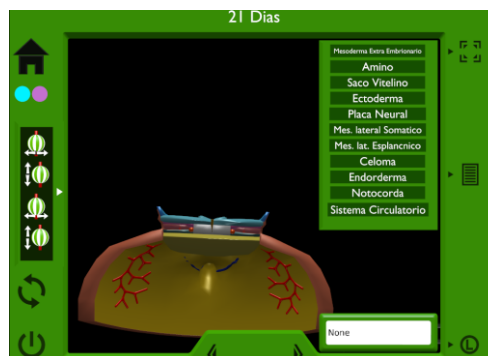
Fig. 6. Transversal cut from the 21-day conceptus observed on Fig. 5.

Fig. 6 shows a transversal cut of the 21-day conceptus from Fig. 5. This model is generated after clicking in the white circle associated to number 2.