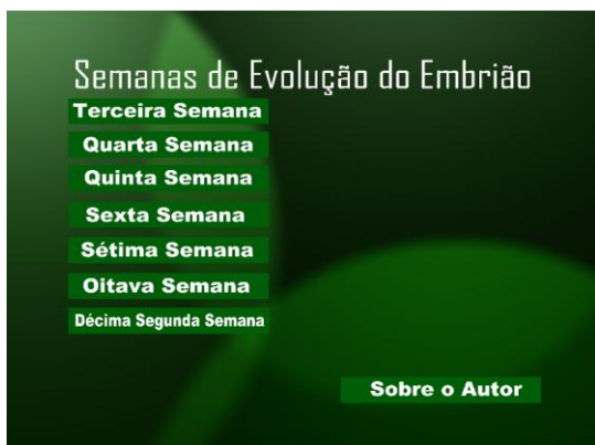
Fig. 3. Third screen of the system menu EMBRIO v2.0.

In the case of our VLE, there aren't ultrasonography videos available yet. When clicking at the button to visualize the 3D-models of human embryos or fetuses we can see several options according to the age of the conceptus (Fig. 3). The user can choose any age present in this menu, and to illustrate the system, we chose the button Terceira Semana (Third Week) on Fig. 3, which leads to Fig. 4.