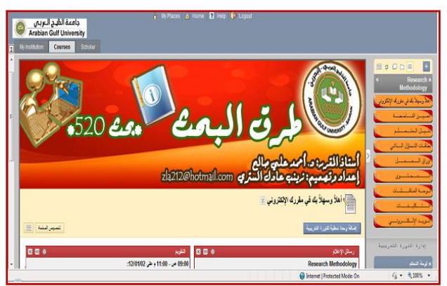
Fig. 2. Research method course homepage.

be measured. In general, the evaluation consists of two phases: formative and summative. Formative evaluation is iterative and is done throughout the design and development processes. This occurs all throughout Hannifin and Peck ID model [27]. Summative evaluation consists of tests that are done after the learning materials are delivered (after complete studying each unit of the course). The results from these test help to inform the instructional designer and the stake holders on whether or not the learning accomplished its original goals outlined in the analysis phase.