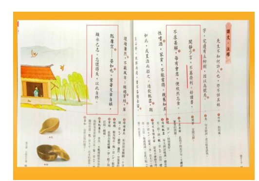
Fig. 3. PowerPoint slides designed by Miss W.

Third, the participants tended to duplicate the remedial teacher's use of technology in a class. Perhaps these participants did not have sufficient confidence for using technology due to lack of teaching experience. For example, S5 noticed that Miss W drew a box to highlight the important area of a text, as displayed in Fig. 3. Thus, S5 did the same thing when she taught the class, as displayed in Fig. 4.