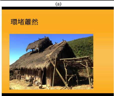
Fig. 1. PowerPoint slides designed by S6.

Second, the participants liked using Internet resources to provide additional information in teaching. It appeared that teacher candidates were highly capable of searching for related instructional materials on the Internet. Knowing that most of the remedial students had already read material in regular classes, the participants attempted to do something different with these students during remedial instruction. For example, S5 used Google maps while teaching the lesson, "Remember the Night" and displayed Su Shi's derogated routes to help students relate to the challenges and difficulties