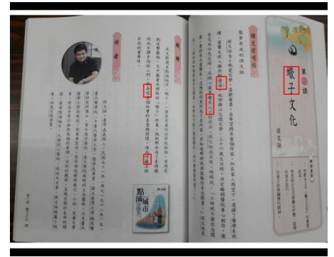
Fig. 4. PowerPoint slides designed by S5.