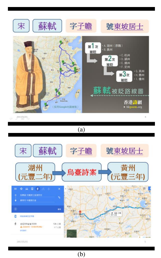
Fig. 2. PowerPoint slides designed by S5.

Third, the participants tended to duplicate the remedial teacher's use of technology in a class. Perhaps these participants did not have sufficient confidence for using technology due to lack of teaching experience. For example, S5 noticed that Miss W drew a box to highlight the important area of a text, as displayed in Fig. 3. Thus, S5 did the same thing when she taught the class, as displayed in Fig. 4.