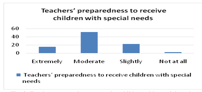
Fig. 3. Teachers preparedness to receive children with special needs.

The statistic presented below Fig. 3 is designed to evaluate the way teachers feel prepared to work in an inclusive classroom. The results show a great majority of teachers declare themselves slightly prepared to teach children with special needs. A vast majority of about 52% of teachers say that they feel moderately ready whereas 23% of them consider themselves slightly ready to receive children with special needs. Also, 16% of them are feeling confident in their capacity of dealing with students in an inclusive classroom.