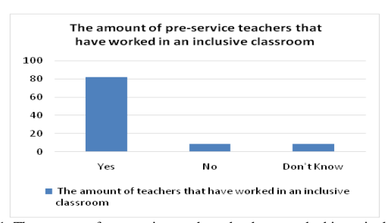
Fig. 1. The amount of pre-service teachers that have worked in an inclusive classroom.

regardless of their mental health issues, emotional and behavioural disorders, race, sex, creed, ethnicity or disability. The first question is entitled to show if children with special needs are included in mainstream schools.