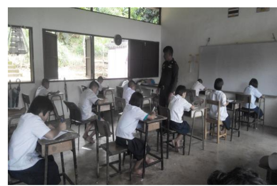
Fig. 3. Fabric of Karen Fabric of Karen, cultural and security assessment.

Step 4: Evaluate and summarize 4 topics: 1) Using the participatory action research process involved in concept of the Sufficiency Economy Philosophy for developing Fabric of Karen Wisdom for the Royal initiatives in Kanchanaburi Border Patrol Police schools 2) cultural assessment, 3) security assessment and 4) in-depth interview. The focus is on participating in Border Patrol Police Schools at all step as in Fig. 3.