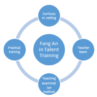
Fig. 1. Operational guarantee system with talent training program as the core.

common prosperity. The development of disciplines leads to the development of industries, and the development of industries promotes the progress of disciplines. Subject chain and industry chain linking can also promote the employment of students. Students can use what they have learned after four years of professional study and smoothly adapt to the industry work with their quick application of what they have learned [6].